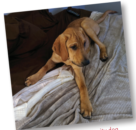
Bruno's first morning as a city dog. He now lives in St.Louis.

We are calling Teddy Georgie and so far he's responding! We are thinking Bjørn as a middle name (it means bear in Norwegian!) They played for nearly two hours yesterday and I stayed home today to give them more time to get settled. He really wants to meet the cats and so far, he's doing well just looking! Lots of treats for looking and not lunging! He loves to cuddle and we just love him!