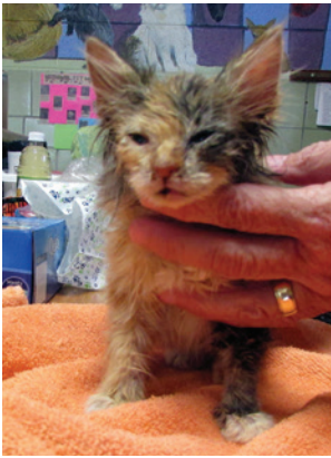
Sunflower, the day she was brought in and during her recovery.

Fostering kittens can be compared to keeping children healthy. Both need to develop immunity to disease by immunizations and exposures to pathogens. Both can be subjected to injuries just by not being cautious and being unaware of danger in their environments. I have been fostering kittens for a short time now and have seen examples of each.