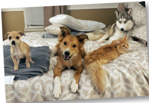
Jag the cat and Sam the Chihuahua, along with their new siblings!