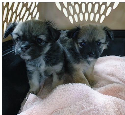
Two of our recently rescued parvo puppies, Hansel and Gretel. Hansel survived treatment; unfortunately Gretel, along with sister Pearl, succumbed to the disease at 8 weeks.

To help protect your dog from canine parvovirus, a proper vaccination schedule is needed. Puppies should receive a parvovirus vaccination as part of their vaccine protocol. You should discuss with your veterinarian the proper vaccination schedule for your pet. ■