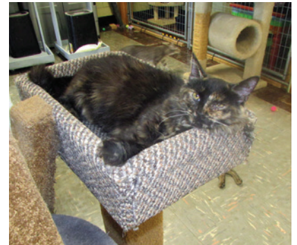
...while Amora prefers to rule from her roost....