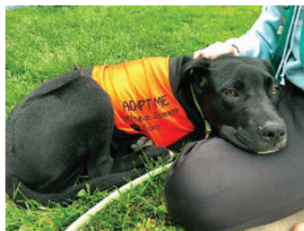
Macintosh went to the Girl Scout booth at the Artisan Fair! He was a little skittish with all the people but warmed up to the girls!