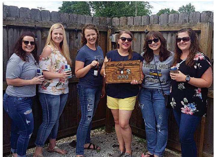
T-Town Class of 2002