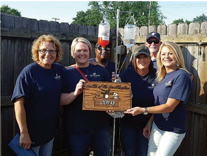
Crossroads Cancer Center