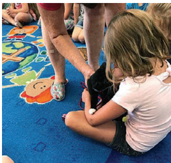
Two of our wonderful volunteers visited Little Lambs Daycare with two of our adoptable kittens.