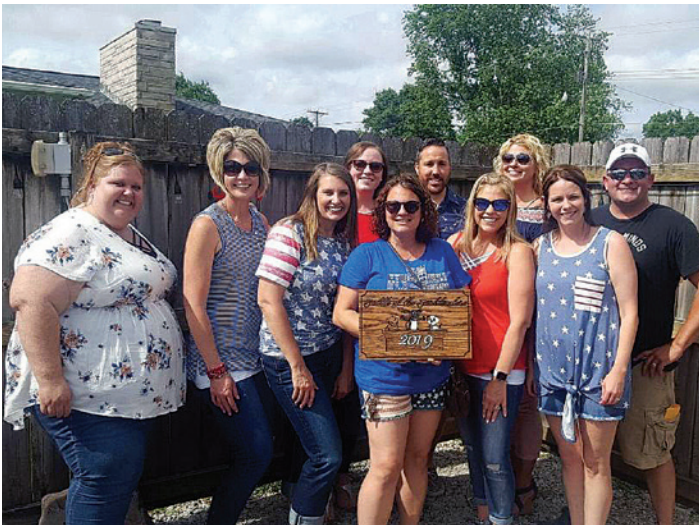
T-Town Class of 2001