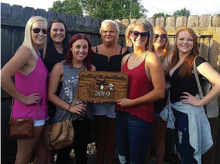
Tasha's Pet Daycare & Spa

To the teams, the teams' supporters, the patrons, the helpers, the businesses, anyone and everyone who helped spread the word, those who came out, and/or donated to the cause – THANK YOU FROM THE BOTTOM OF OUR HEARTS & PAWS!!! ■