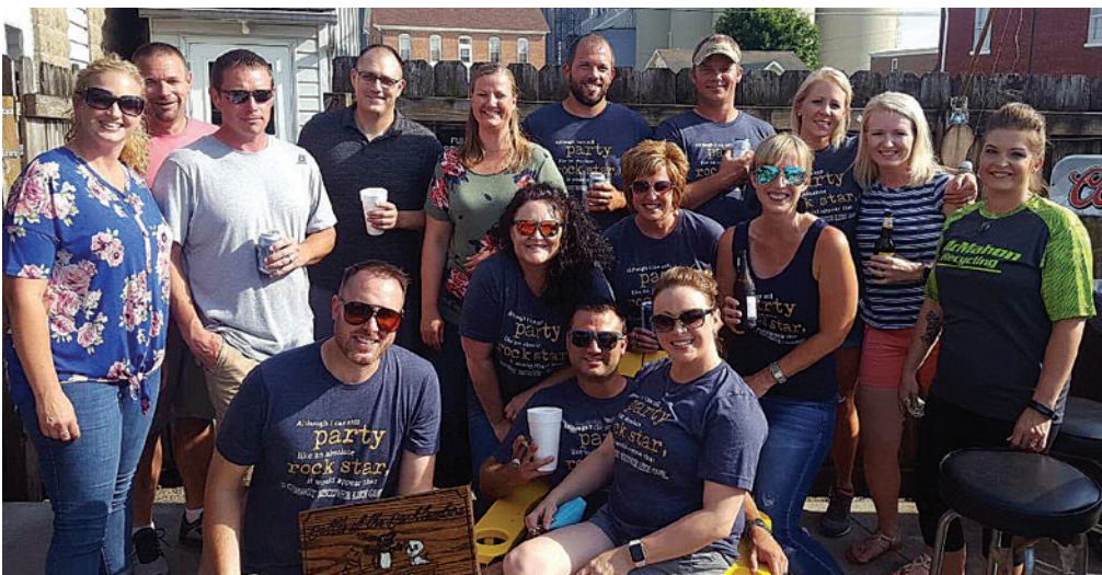
T-Town Class of 2000